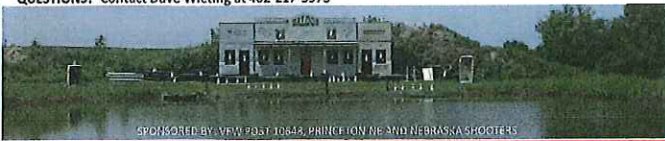
SPONSORED BY: VFW POST 10848, BRINCLON NE AND NEBRASKA SHOOTERS

WHEN: Sunday April 26, 2015 TIME: Sign-in from Noon to 1pm (1200-1300) Early registration also available at www.nebraskashooters.com WHERE: Nebraska Shooters Range, 3200 Gage Road near Firth, NE WHO: All persons 14 and over are welcome COST: $35.00 per person COURSE: 11 Marksmen Stations to rotate through ARMS/AMMO: All firearms and ammo provided LUNCH: Lunch available from the Boy Scouts PRIZES: 1st Place- $100.00 and CCW Course 2nd Place- $75.00 3rd Place- $50.00 Door prizes! 50/50 raffle! Possible raffle to shoot vintage WW II on full automatic! QUESTIONS? Contact Dave Wieting at 402-217-3973